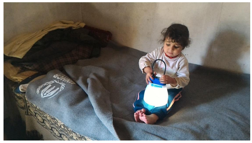
Distribution takes place for blankets and solar lanterns in Dhamar through CCCM partner Spirit Youth Foundation