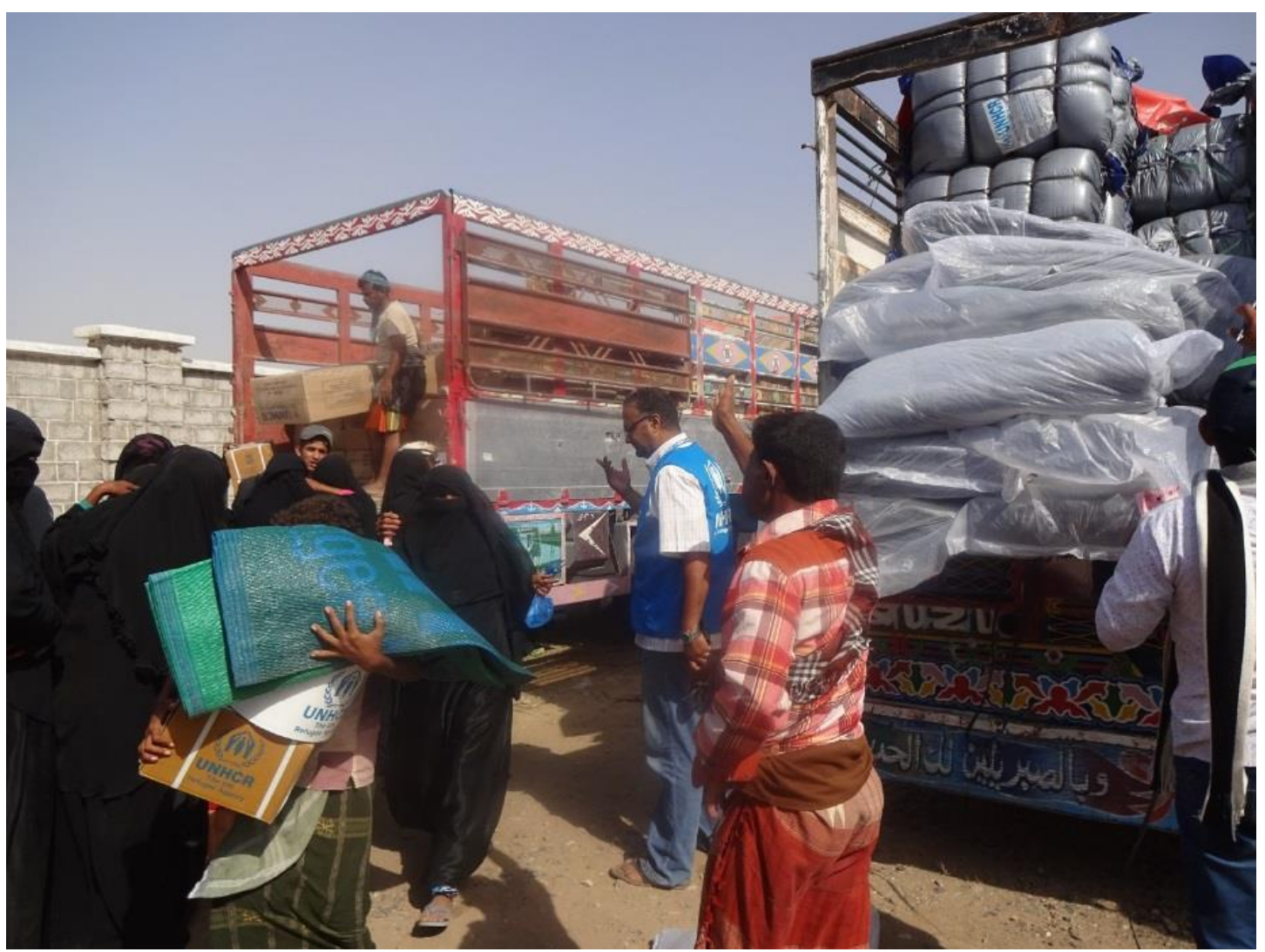
Support including shelter, NFI and winterization assistance reach in-need families across Yemen.